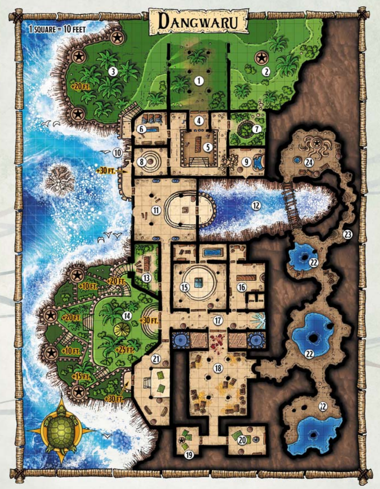
MAP 3: DANGWARU