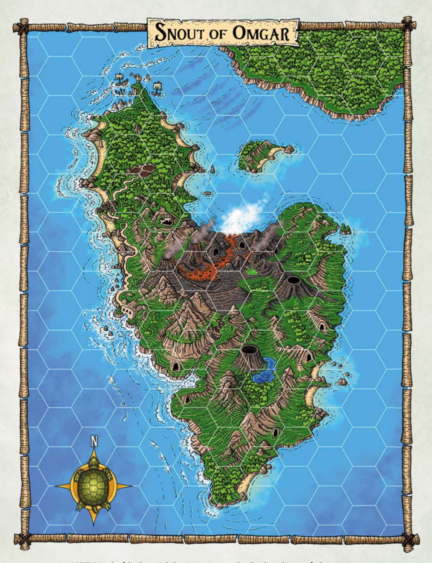
\bigcirc 2017 Wizards of the Coast LLC. Permission is granted to distribute this page for home game use.