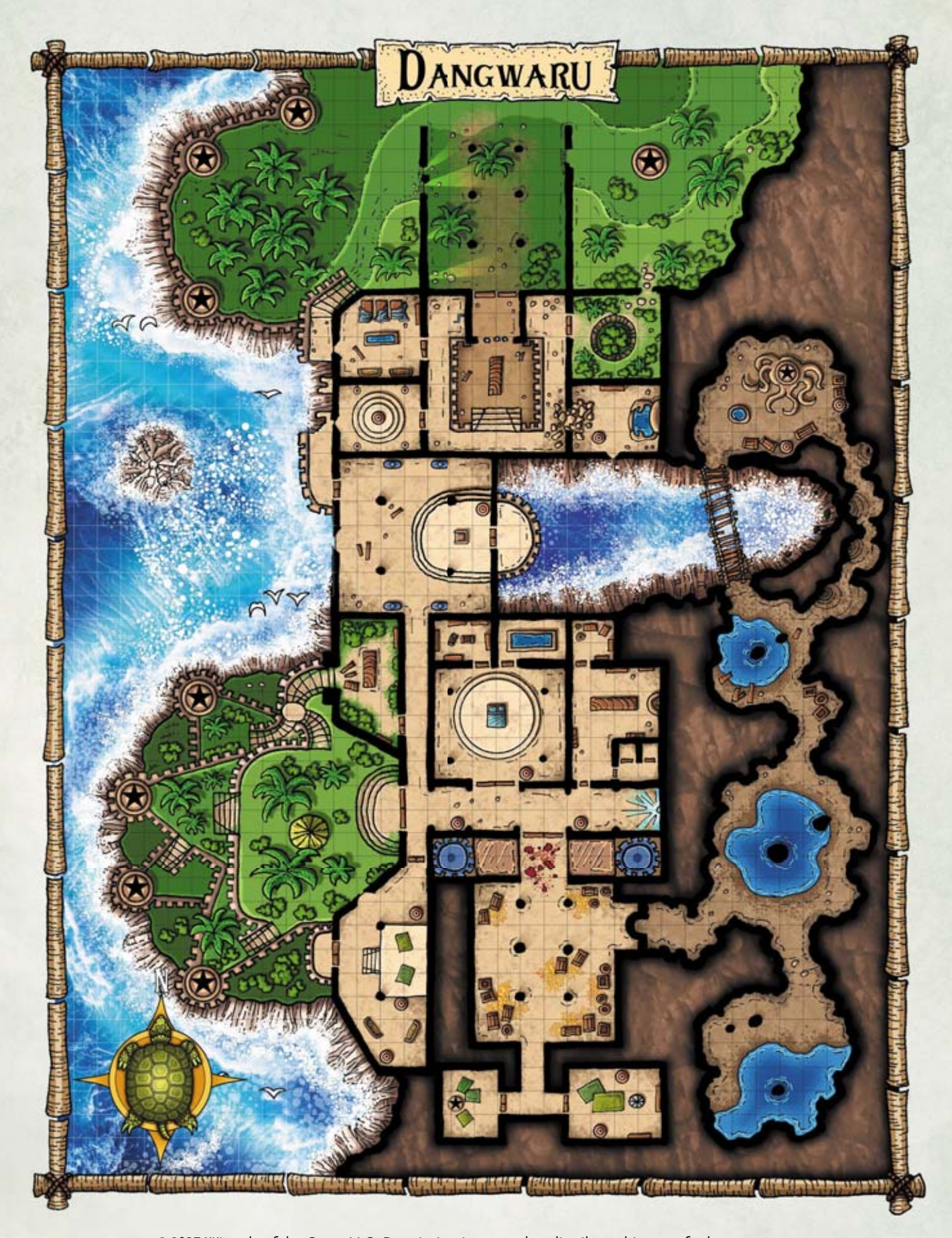
©2017 Wizards of the Coast LLC. Permission is granted to distribute this page for home game use.