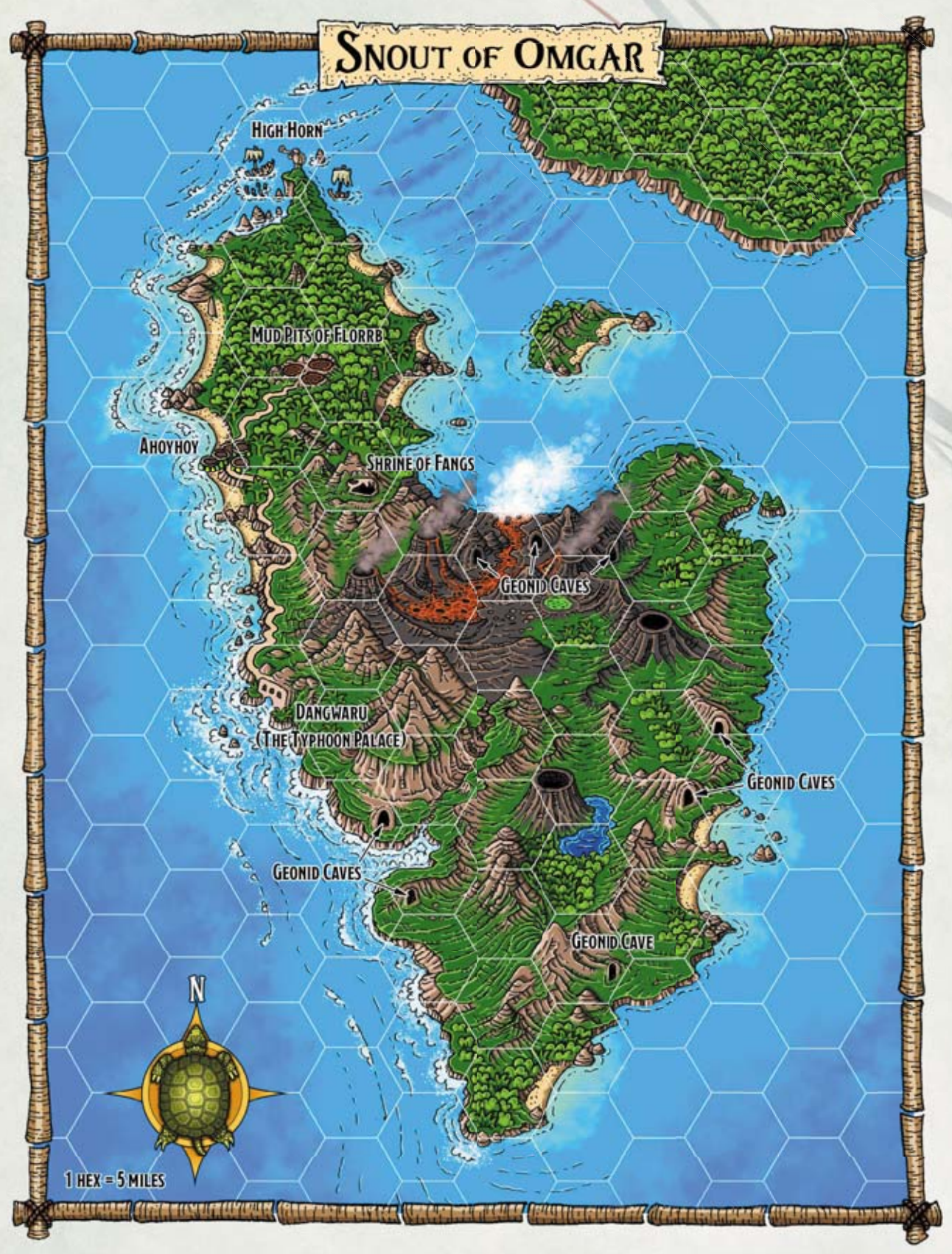
MAP 1: SNOUT OF OMGAR